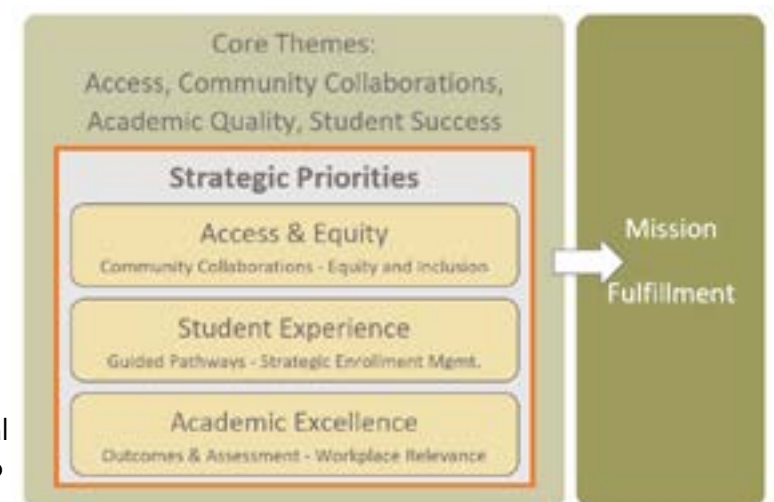
2020-21 Strategic Plan Organization

Infused through the priority work of the College, the core themes serve as the foundation for the College's Strategic Plan. Chemeketa's 2020–21 Strategic Plan outlines three core theme-driven strategic priorities: Access and Equity, Student Experience, and Academic Excellence. Each is linked to two significant initiatives. The strategic priorities are designed to advance the core themes, impact institutional indicators, and guide the College to mission fulfillment.